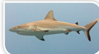
Female Grey Reef Shark