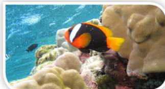
Black Anemone Fish