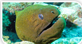
Giant Moray Eel