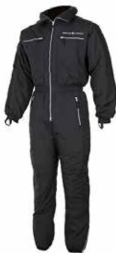
Layer 2: Under suit