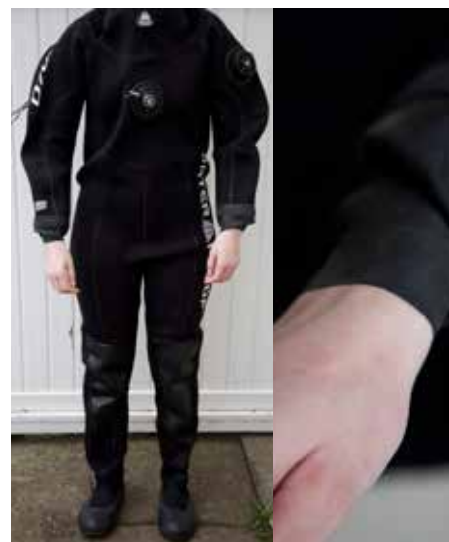
Layer 3: Dry suit