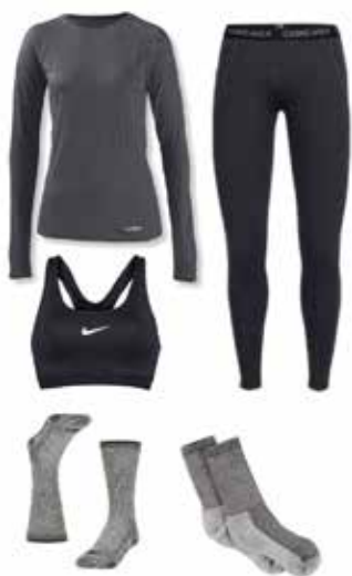
Layer 1: Base Layer