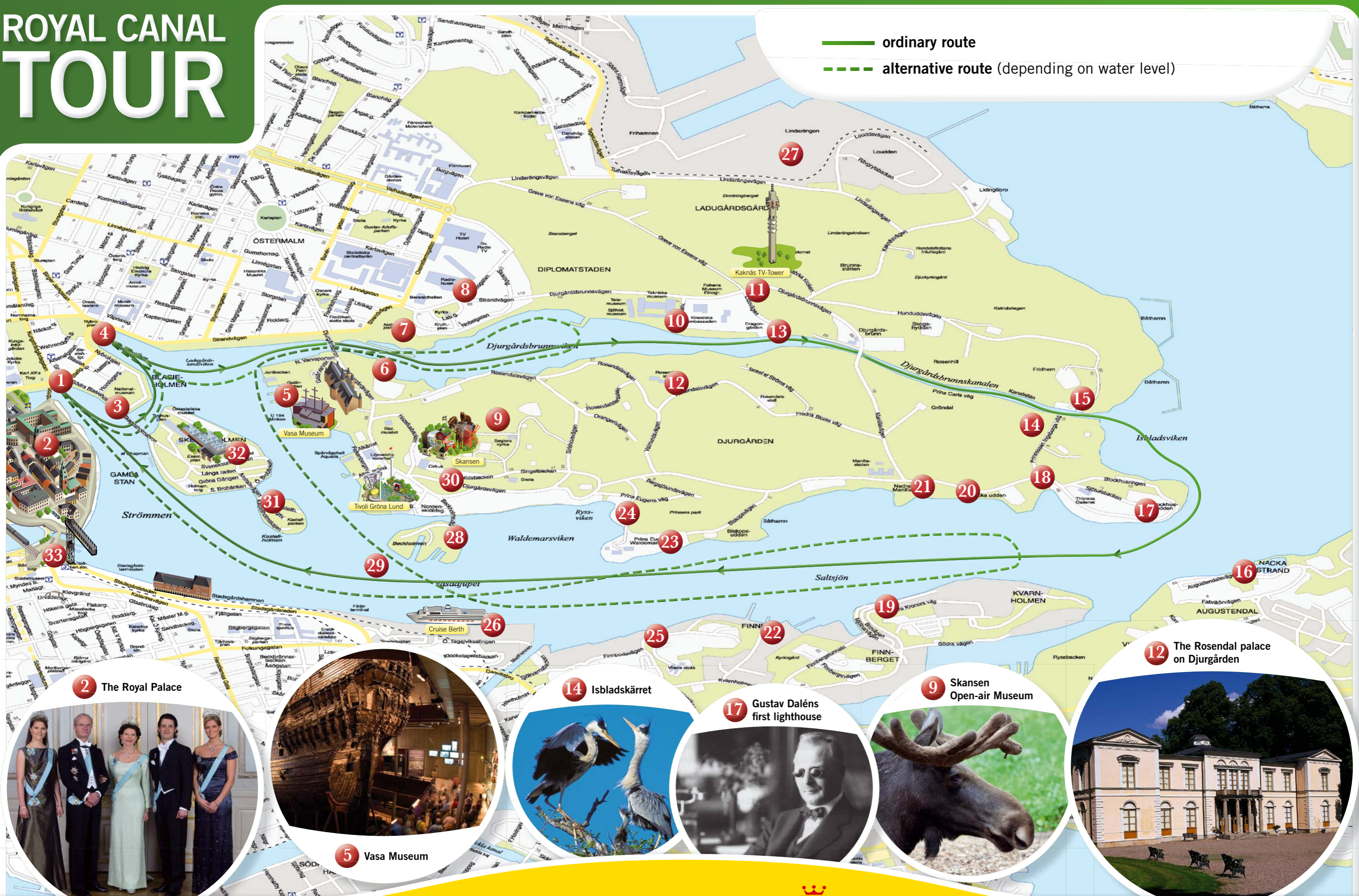
2 The Royal Palace

— ordinary route - - - alternative route (depending on water level)