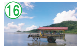
16 Water Buffalo Cart