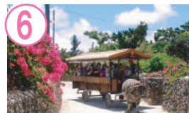
6 Water Buffalo Cart