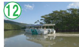
12 Mangrove(Nakama River)