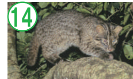
14 Iriomote Wildcat