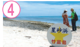
4 Kaiji-hama(the shore of star sands)