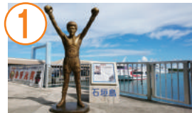
1 Yoko Gushiken bronze statue